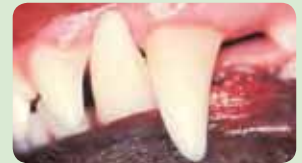
(1) Healthy mouth