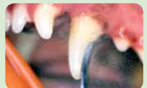
Removing the calculus using an ultrasonic scaler, followed by polishing the teeth is a very effective form of treatment