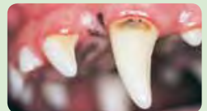
(2) Gingivitis – with early calculus