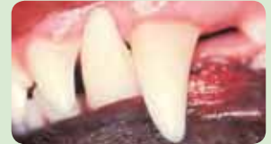
(1) Healthy mouth