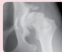
X-ray of an arthritic hip joint in a dog. The symptoms of arthritis are often much worse in overweight pets.